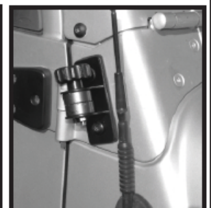
TJ-LJ Install pic.9

Step 7. When doors are reinstalled remove mirror arm from bracket. Place bushings back into arm. Tighten knob. (pic.8-9)