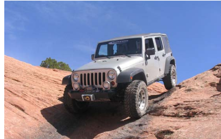
Hells gate, Moab UT