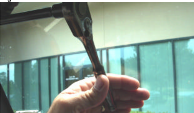
Step 3 – When unscrewing bolts take care to not hit your windshield with your wrench. Place hand over handle as shown (Fig.9)