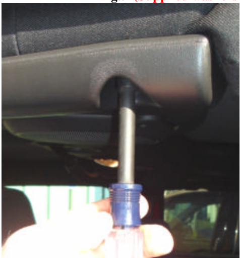
Fig.5 (Supplied washers are not needed) Fig.6