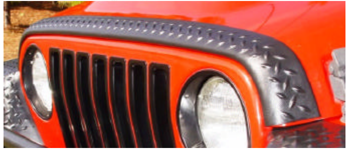
11650.17 (Hood Stone Guard) Installation Instructions