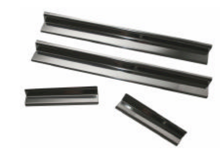
4dr version pictured. 11119.05, 11216.11