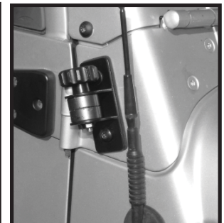
TJ-LJ Install pic.9

Step 7. When doors are reinstalled remove mirror arm from bracket. Place bushings back into arm. Tighten knob. (pic.8-9)