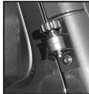
JK Install pic.8

NOTE: TJ applications are designed to be used with doors off. Some visibility on passenger side will be blocked if used with doors.